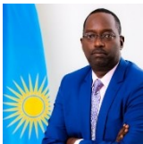
Dr Daniel Ngamije Minister of Health Government of Rwanda Rwanda

Dr. Daniel Ngamije has been the Rwanda Minister of Health since February 2020. In June 2018 he joined World Health Organization (WHO) Rwanda Country Office as National Programme Officer and his duties among others were to provide technical assistance to the Ministry of Health on the development of Malaria and Neglected Tropical Diseases policies, strategies, guidelines, standards and norms as well as support and assist to define programme implementation modalities, provide assistance to conduct periodical program review and resources mobilization.