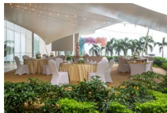
Prior Evening Reception venue