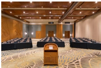
Grand Pacific ballroom

The exhibition area will be outside the ballroom and will also serve as the refreshments area. Lunch will be served in the Tejas Banquet Hall.