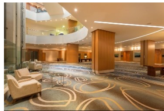
Exhibition and foyer area