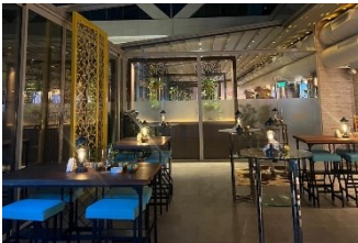
Prior Evening Reception venue

Our event utilizes the Diamond Ballroom which can accommodate our target audience of around 80 delegates and 20 speakers as well as house our sponsors' exhibits in the ballroom foyer. The ballroom can be divided to accommodate our separate program streams. Lunch will be served in the ballroom or Les Cuisines Restaurant.