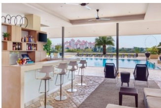
Prior Evening Reception venue